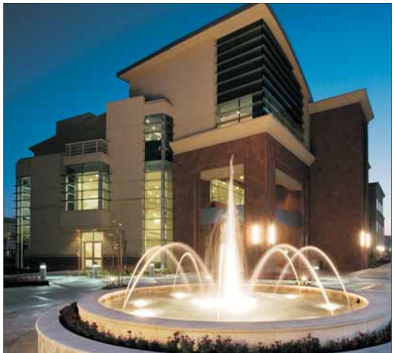
Kern Schools Federal Credit Union Corporate Offices, 9500 Ming Ave.

Kern Schools Federal Credit Union believes in serving our community. KSFCU employees collectively raised over $10,000 to brighten the holidays for families from the Henrietta Weill Memorial Child Guidance Clinic. The generosity not only touched the families requesting assistance...but touched our employees who saw first hand the appreciation of their overwhelming generosity.